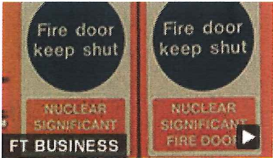
UK's expensive nuclear renaissance