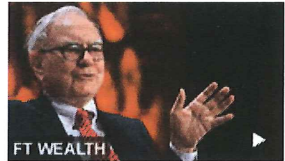
Buffett on giving

Printed from: http://www.ft.com/cms/s/0/92218314-66b7-11e5-a57f-21b88f7d973f.html